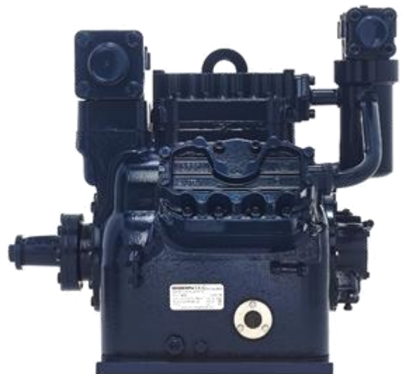
Open Type Compressor